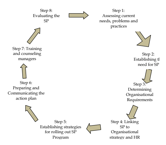
Figure 2.2. An Integrated model for Succession Planning: Source: Adapted from Rothwell, PACE and Deegan

Based on the literature surveyed an integrated model for succession planning can now be developed. From this point the model developed for succession planning will be referred to as the model.