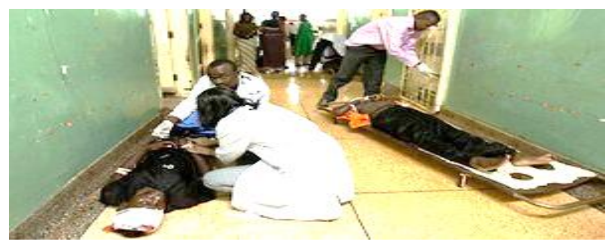
Figure 1: Physicians from Mulago Hospital attend to World Cup final watchers caught in the terrorist bombings on Sunday.

Uganda continued to use the Anti-terrorism Act (2002) as its main legal framework for deterring, disrupting, and prosecuting terrorist activity and incidents in Uganda. The Uganda Police Force (UPF) Counterterrorism Directorate is the lead Ugandan law enforcement entity charged with investigating, disrupting, and responding to terrorist incidents. While Ugandan law enforcement officers assigned to this directorate are highly motivated, the UPF overall was limited in its capacity to detect, deter, and respond to terrorist incidents due to the lack of manpower, resources, basic skills, and competencies. In addition, police officers are particularly susceptible to corruption. Moreover, the bulk of the counterterrorism police and other law enforcement elements are centrally located in the capital, which limits the effectiveness of law enforcement in the border regions and all areas outside Kampala. The UPF still lacks the technological resources needed to conduct comprehensive terrorism investigations in the most effective manner. Following the Kyadondo rugby club and Ethiopian village restaurant attacks 2010 in Uganda, Westgate terrorist attack in Nairobi in 2013, and the Garrisa university terror attack which left dozens dead and wounded the UPF has held regular inter-agency meetings to ensure coordination among its security agencies such as Internal Security Organization (ISO), External