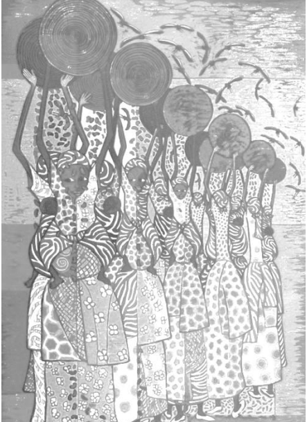
Waiting for the wind by Fred Mutebi.