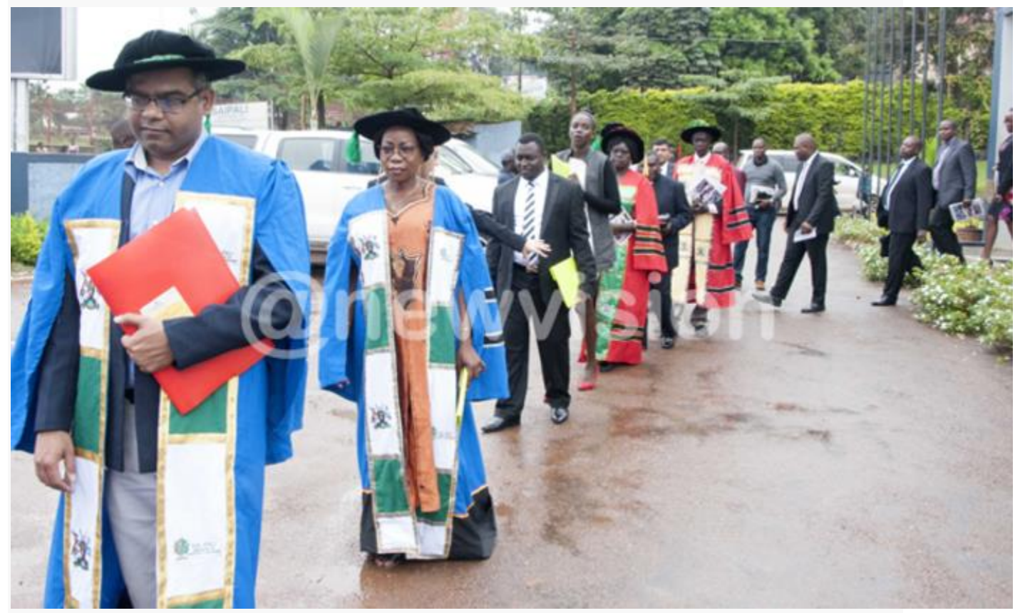
Sai Pali Institute of Technology and Management graduation ceremony on Friday 26 April 2019 held at their Institute.

A total of 152 students graduated from the Sai Pali Institute of Technology and Management in different ICT and management disciplines